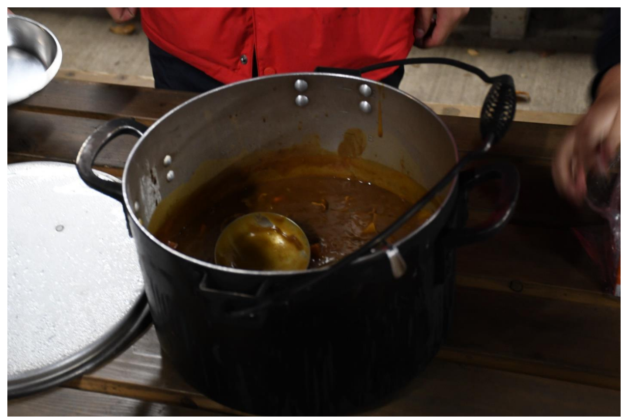
One of the IPLA event during my stay. In the picture is our group's curry.