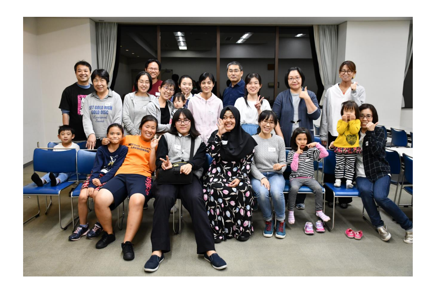
Thank you Good luck Have fun